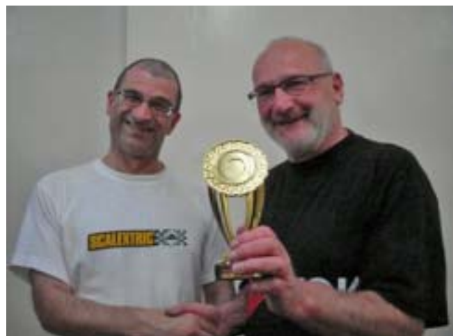
Me pulling faces with the top racers from each class