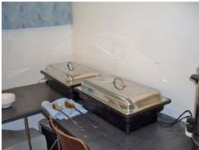
What lies beneath those metal lids...

currently and also the fact that it was sunny today so some people wanted to go out and about later on.