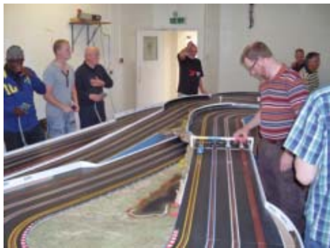
Time for a bit of practise before the main

The revised format for 2014 of one round per day seems to have gone down very well as it allowed you to do something else in the afternoon especially as the World Cup is on ➡