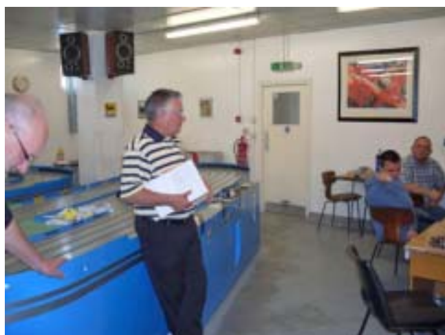
Driver's briefing including "don't eat the curry yet!"