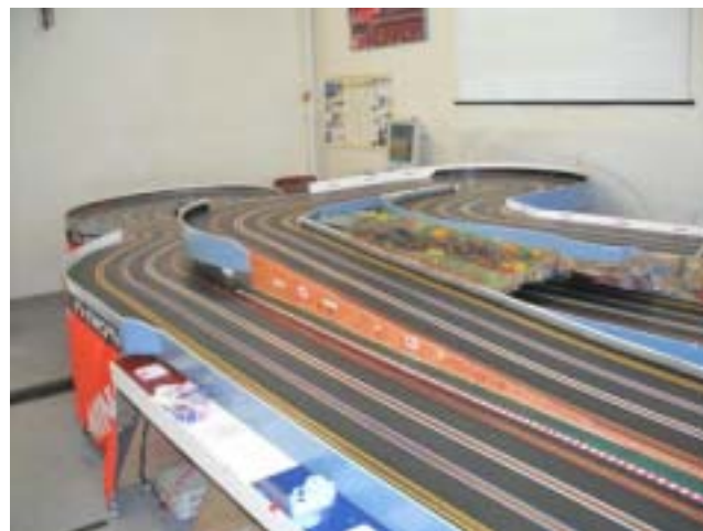
A view of a really nice club track