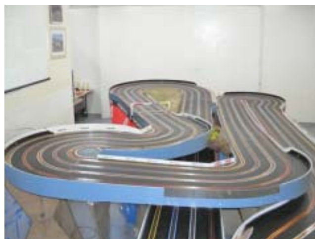
And from another angle