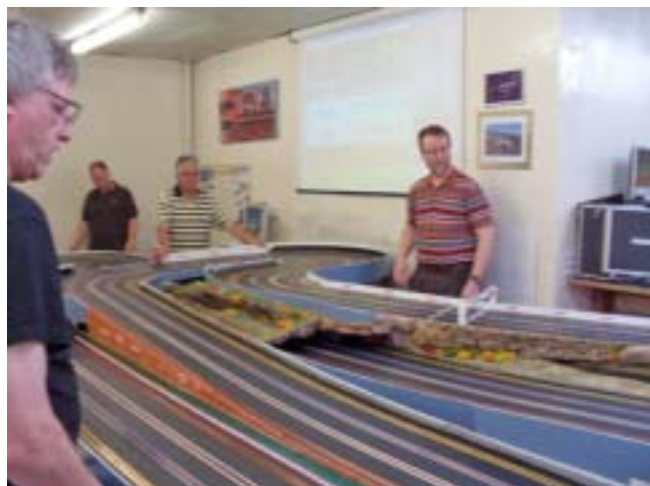
Competitors admire the track