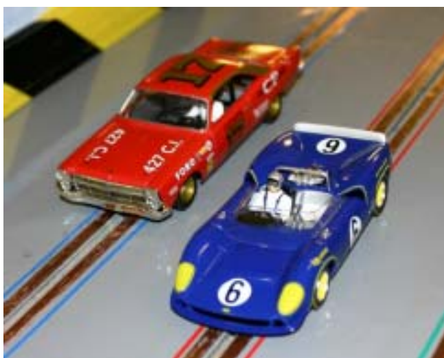
Revell / Monogram Limited Donohue Lola and Pearson Fairlane

Finally we turn to plastic and RTR cars and the Cartrix have now released the Ferrari D50