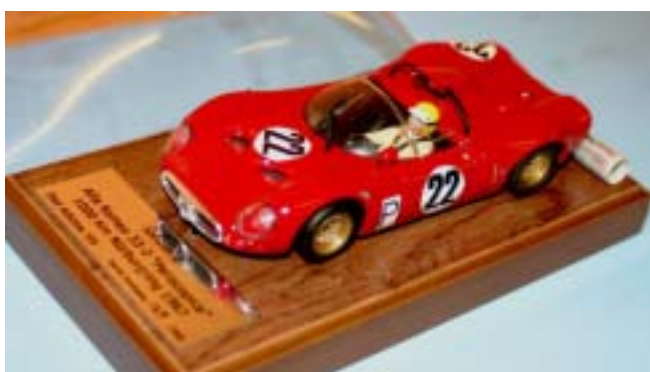
Cursa Models Alfa Romeo 33/2 "Periscopica"

A welcome arrival and well worth the wait was my Alfa Romeo 33/2 "Periscopica" from Cursa models. This beautifully made 1/32 nd scale car represents the #22 machine started after qualifying 14 th by Businello / Zecedi at the 1967 Nurburgring 1,000 KM/s, part way through the race the quicker sister car of De Adamich / Galli ran into trouble so this pair took over the #22 car and drove it to 5 th place behind four factory backed Porsche 910s. Running gear is Powerslot sidewinder and it performs very well indeed albeit a slightly faster motor wouldn't go amiss and with the presentation plinth, limited scroll and bubble display top it also looks absolutely superb. I'm looking forward to Cursa's next 1/32 nd release although they are keeping that information secret for now, they do however have a new 1/24 th body kit release in the form of the Seat TC600 which will be available by February in a range of pre-painted colours.