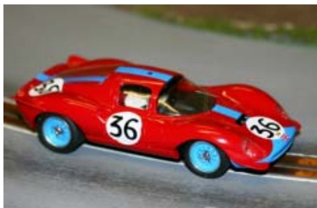
GMC Ferrari Dino 206S