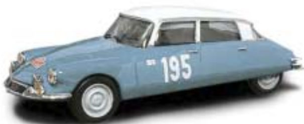
CITROEN DS TIBURON (Ref. 64610) (Available only in SCX Original)

Citroen DS Tiburon – Monte Carlo Rally #195 (new mould) (TBC) Ref. 64610 (original only).