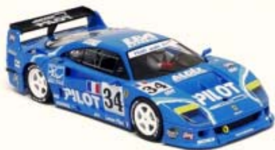
Ferrari 312PB Ickx and Regazzoni

Electronics wise Slot.It has been working hard with new developments for 2010 with two exciting new concepts. First is an addition to the Oxigen Digital system with a new modular unit which can be plugged into the Slot.It controller turning it into a wireless or radio link control system operating on the 2.4 GHz technology. This allows freedom of movement around the circuit and has been developed to allow compatibility with popular digital and =>