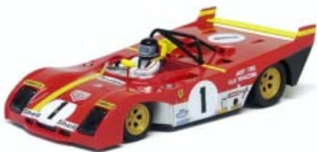
Pilot Ferrari F40

Loads of goodies for the racer and tuner as I mentioned earlier with the CS10T6 (McLaren), CS12T6 (Audi R8C) and CS14T6 (Nissan 390) Evolution 6 type chassis all now available. The CS15L is a new light-weight cockpit interior for the Mazda 787B, while the CH46 is a new evolution cockpit for the F40.