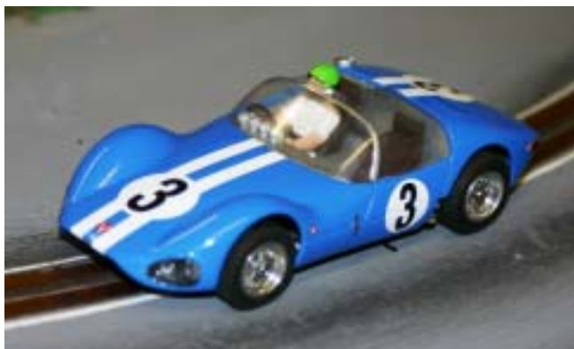
Proto Slot Vaillante VS61

BSR are the Citroen 2CV Dagonet and a variety of Porsche 907 kits that can be made up into any number of factory or privateer entries from 1968 and 1969 world sports car events.